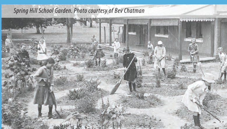
Spring Hill School Garden.

LOOKING WEST ALONG SEATON STREET TO CARCOAR STREET