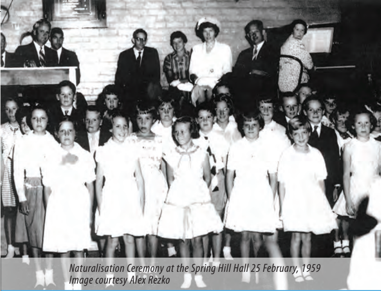
Naturalisation Ceremony at the Spring Hill Hall 25 February, 1959